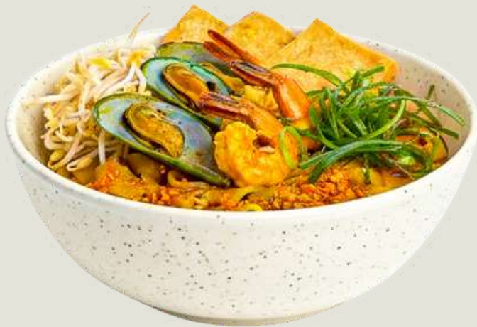
CHICKEN NOODLE SOUP