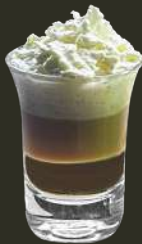
Blow Job Amaretto, Cream Liqueur, and Heavy Cream