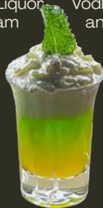
Irish Midori, Cream, and Orange Curacao