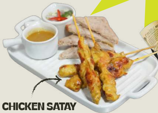
CHICKEN SATAY ฿ 160