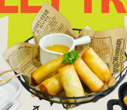
VEGETABLE SPRING ROLL ฿ 160