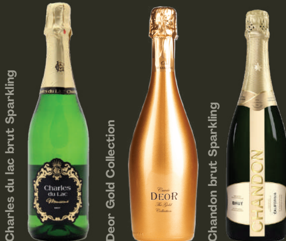
Charles du lac brut Sparkling