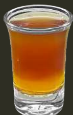
Woo Woo Vodka, Peach Snap, and Cranberry