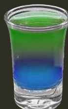
Ukraine Blue Curacao and Pineapple Juice