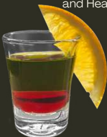
Bob Marley Midori, Orange Curaçao, and Strawberry