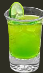
Tokyo Midori, Vodka, and Lemonade