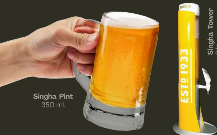
Singha Pint 350 ml.