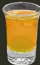
Thailand's Sangsom and Red Bull