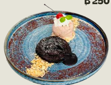
CHOCOLATE LAVA CAKE