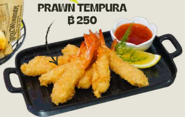
PRAWN TEMPURA ฿ 250